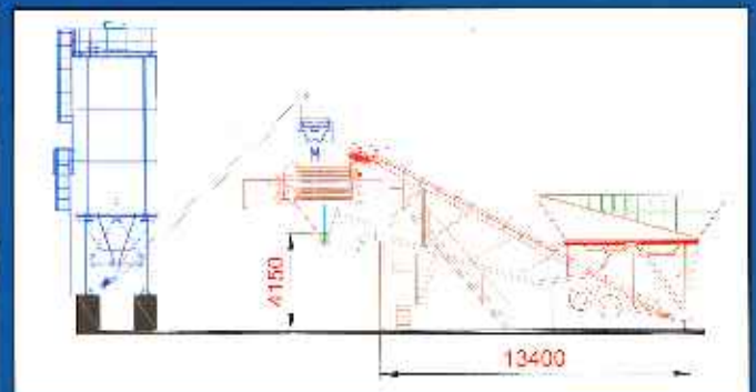
MODEL TRAILER PRODUCTION: 40-60 MC/H