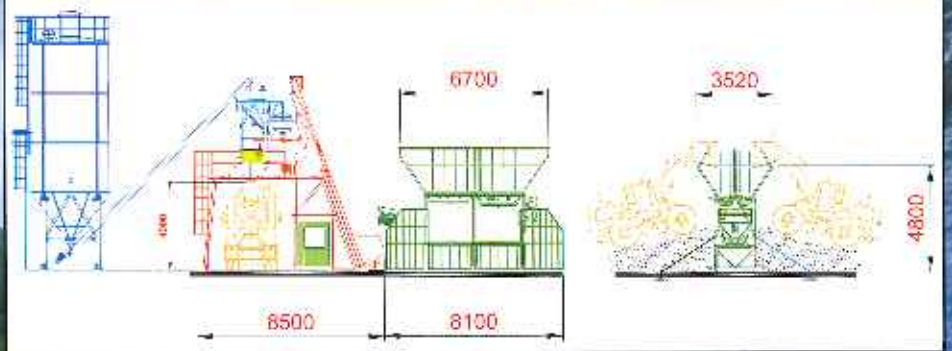
MODEL MOBILE P PRODUCTION: 20-50 MC/H