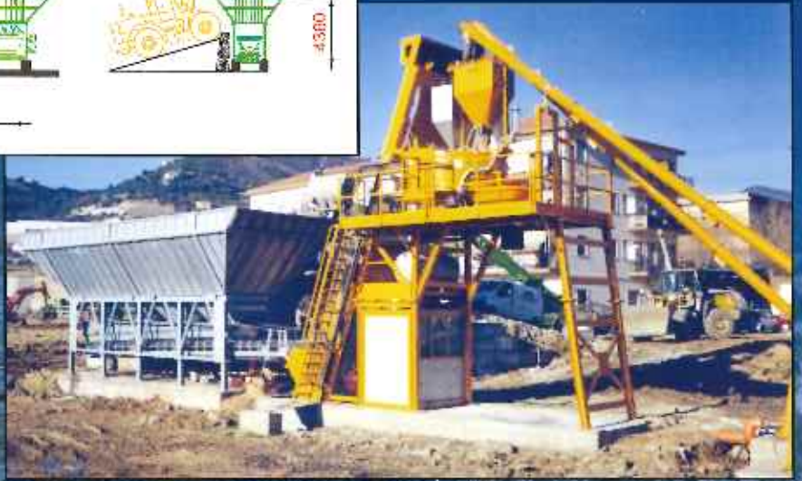
MODEL MOBILE EASY PRODUCTION: 40-100 MC/H